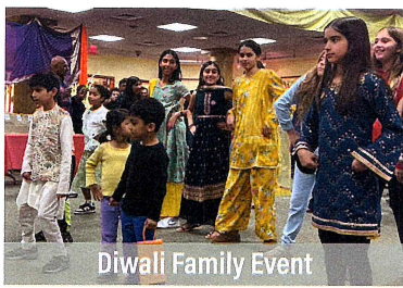
Diwali Family Event