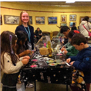
Noon Year's Eve Party