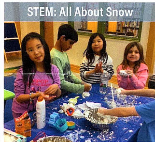
STEM: All About Snow