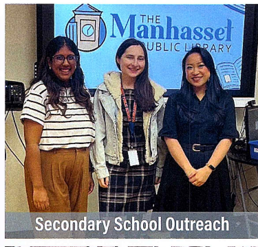
Secondary School Outreach