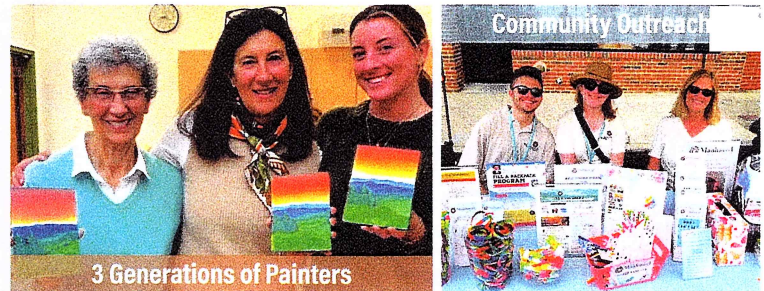
3 Generations of Painters

Our Library collections, services, and programming reflect the interests of our community. Our statistics show that over 16,650 patrons visited the Library and attended 900 programs which entertained and informed. Art exhibits displayed local talent. The History Center continues to chronicle our unique local past. Our younger patrons enjoy exploring our expansive youth collections and participating in fun-filled, skill-based activities that strengthen literacy skills. We have 225 registered teens engaged in Library-sponsored community volunteer activities. Our Library of Things collection has expanded to include items requested by patrons such as a karaoke machine, pickleball set, a metal detector, and laser measuring tools. Our spring Seed Library offers patrons flowers and food in the summer and inspires recipe suggestions throughout the year.