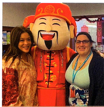
Lunar New Year Fun!