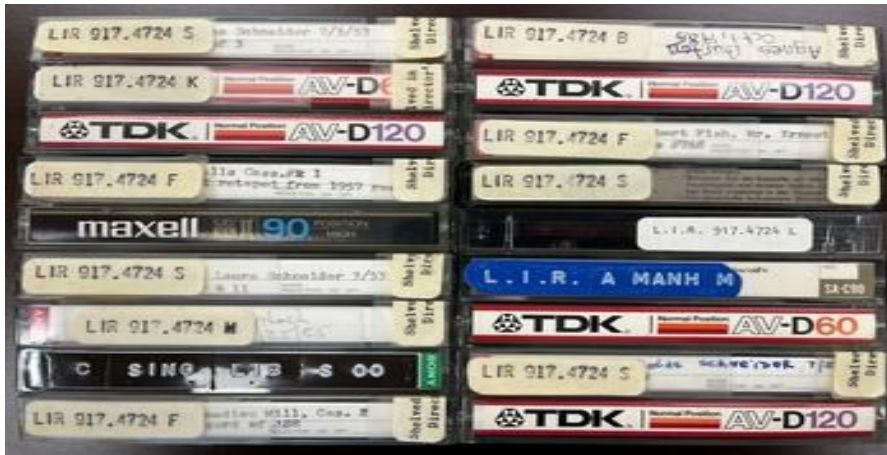
Original cassette tapes from the Library collection that were digitized